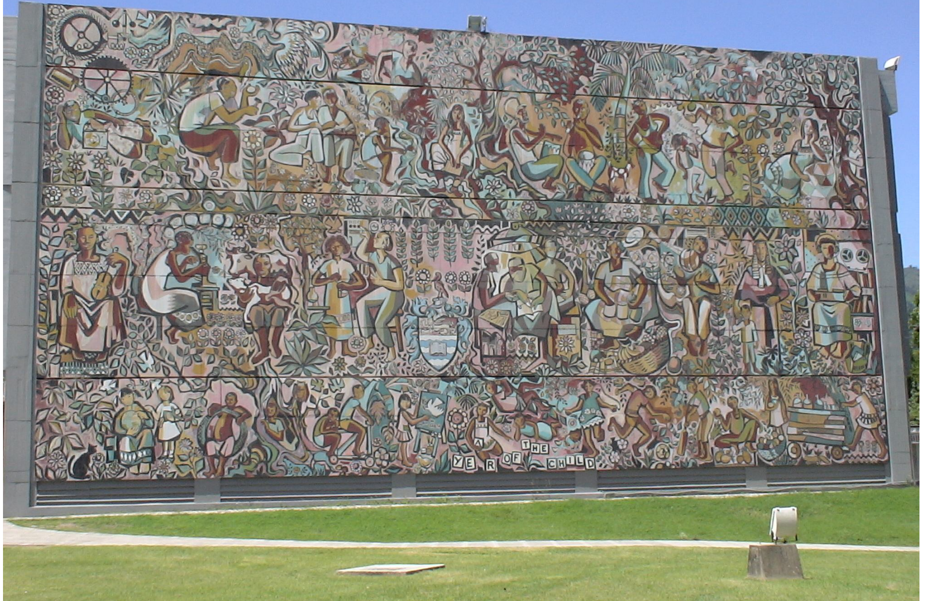
Mural, UWI, Mona Campus