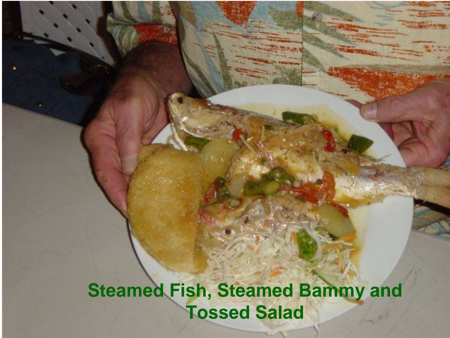
Steamed Fish, Steamed Bammy and Tossed Salad