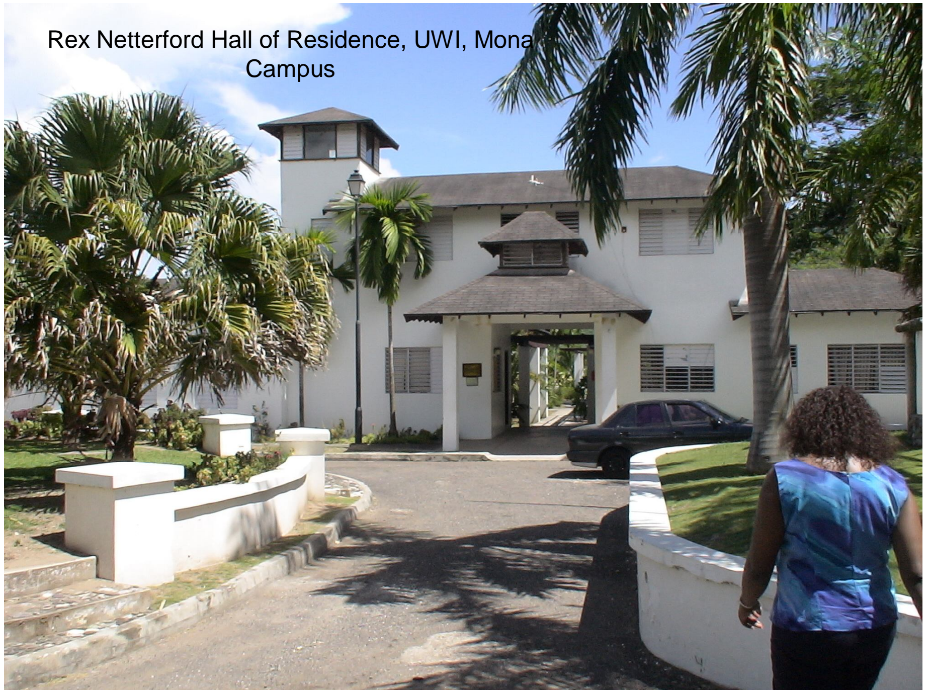
Rex Netterford Hall of Residence, UWI, Mona Campus