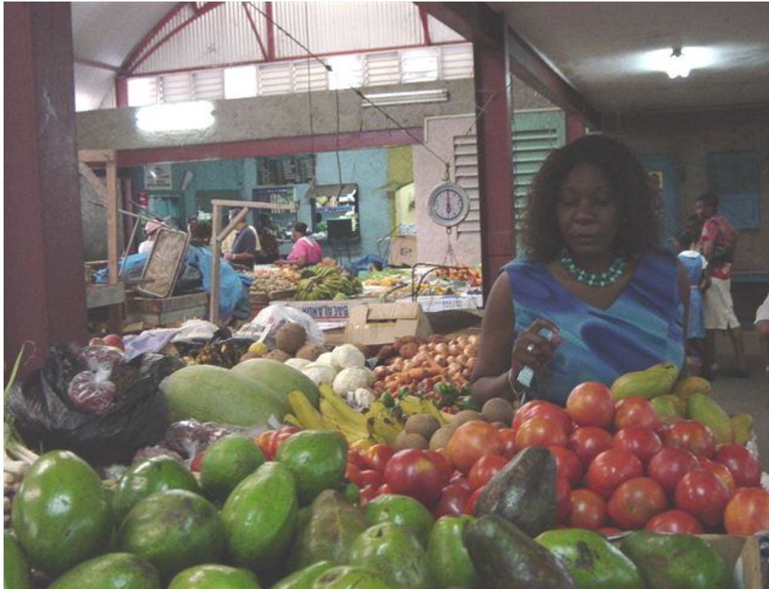
Papine Market, Kingston, Jamaica