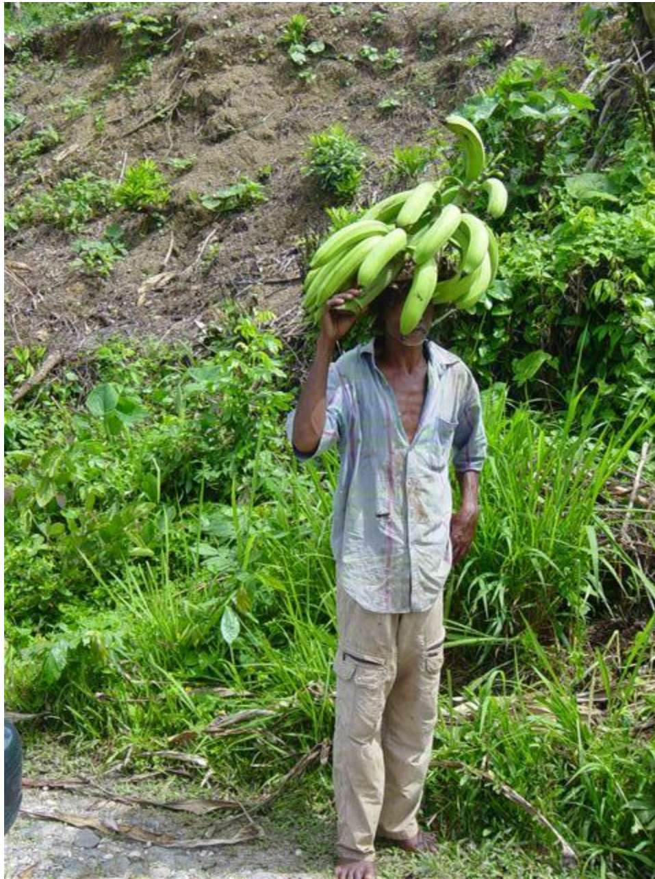
A Jamaican Small Farmer in Portland, Jamaica