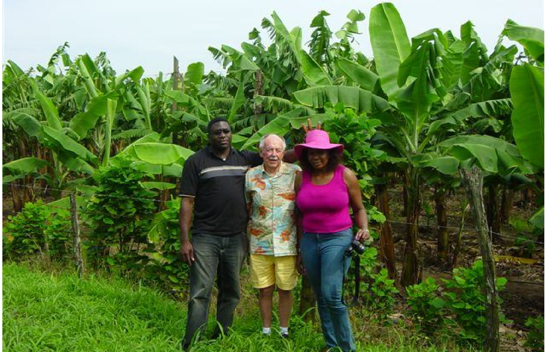
Banana Plantation, St. Mary, Jamaica